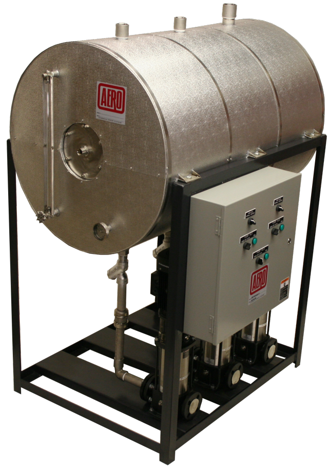
Shown is a 150 Gallon 30 X 48 All Stainless Steel syphon triplex with optional control panel and insulation with aluminum shield.