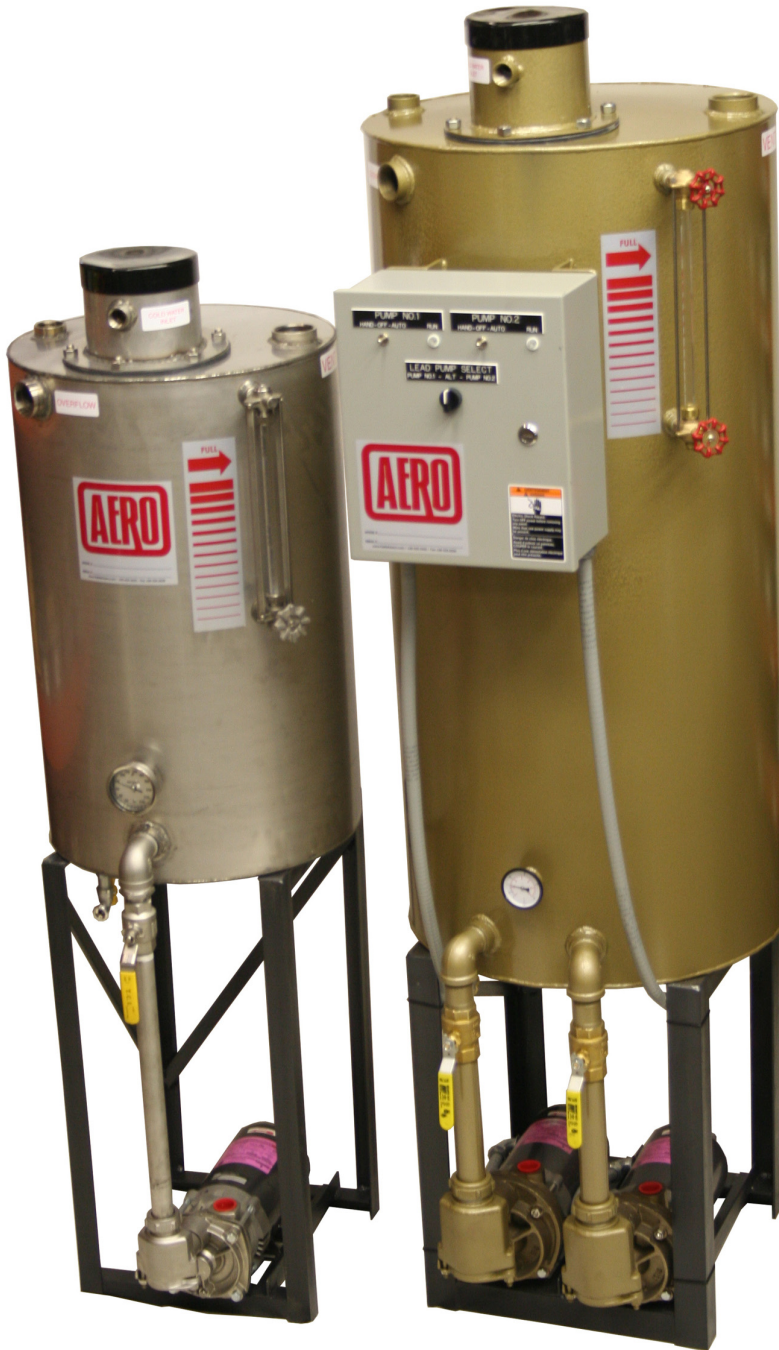
Shown on the left is a 19 X 30 all stainless Steel, non-syphon simplex system with an optional thermometer. Shown on the right is a 23 X 48 carbon steel non-syphon duplex system with an optional control panel and thermometer.